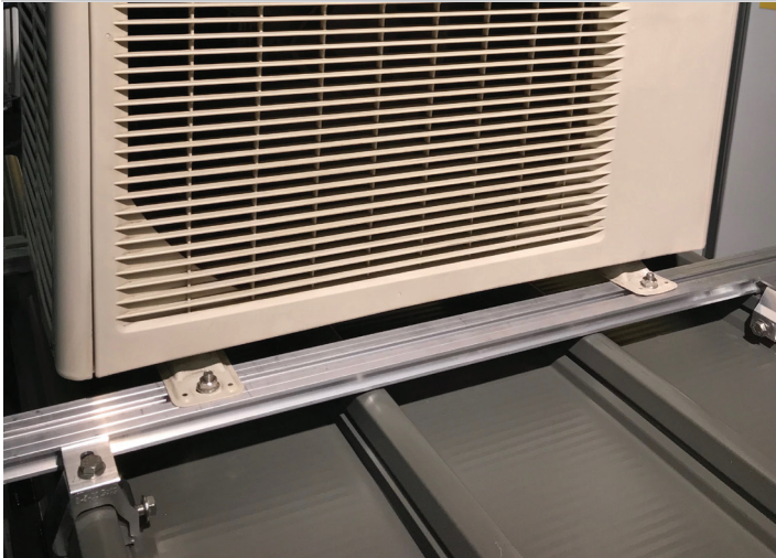
Use this detail for profiles such as KLIP-LOK ® , Speed Deck Ultra ®