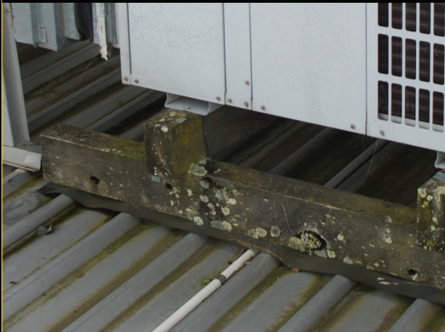
The Wrong Way